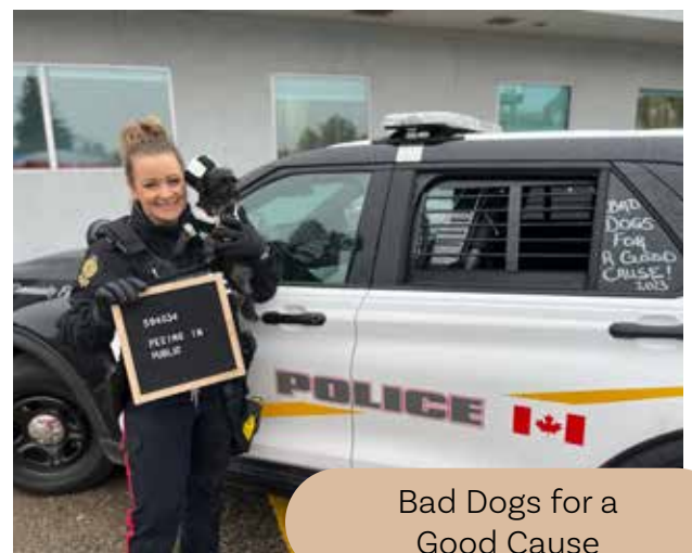
Bad Dogs for a Good Cause