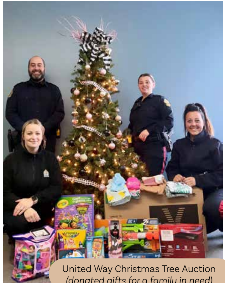
United Way Christmas Tree Auction (donated gifts for a family in need)