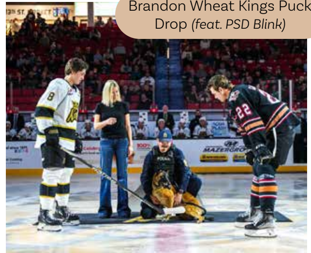
Brandon Wheat Kings Puck Drop (feat. PSD Blink)