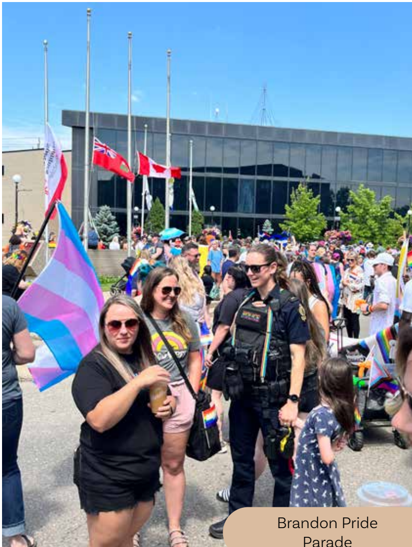
Brandon Pride Parade

Our Vision statement says “ Community First ” and our Mission Statement is “ Committed to Community Safety ”. These are important statements to our members and we put that message forward through our participation in these many community events, presentations and activities.