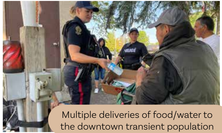
Multiple deliveries of food/water to the downtown transient population