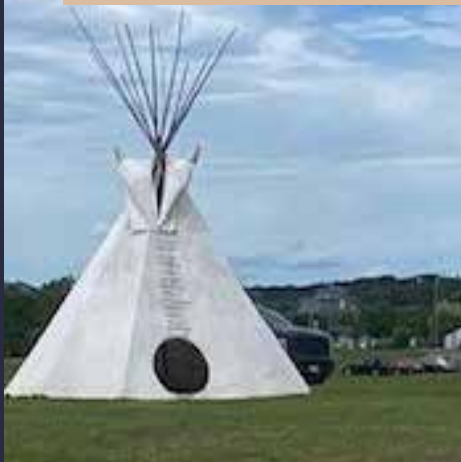
Tipi Challenge Winners