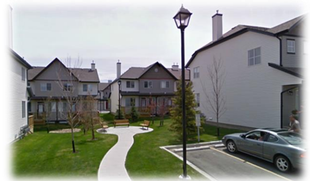
Figure 2: Residential Amenity Area