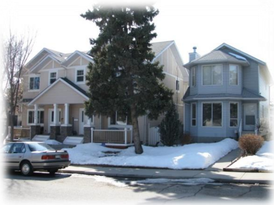
Figure 13: Contextually compatible infill development