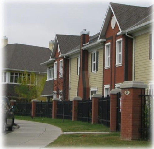
Figure 6: Contextually appropriate fencing