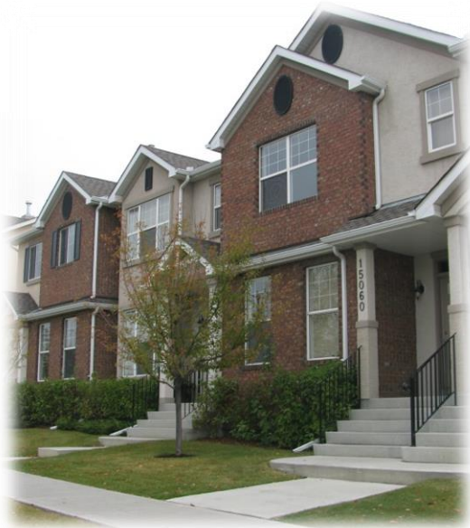
Figure 16: Front façade landscaping