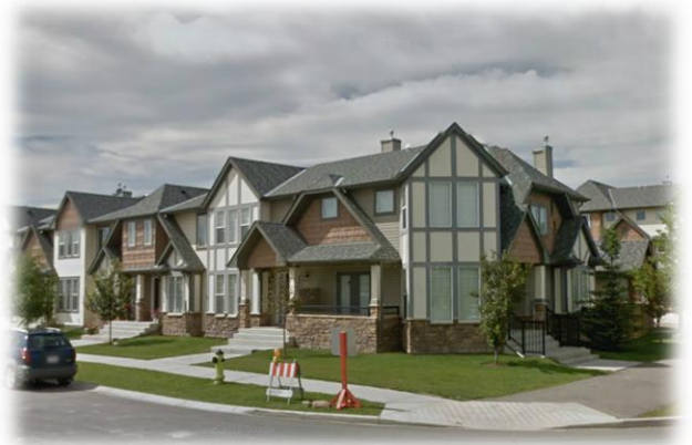
Figure 14: Townhouse addressing both street frontages