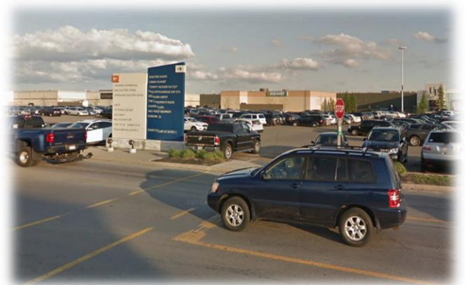
Figure 7: Wayfinding signage