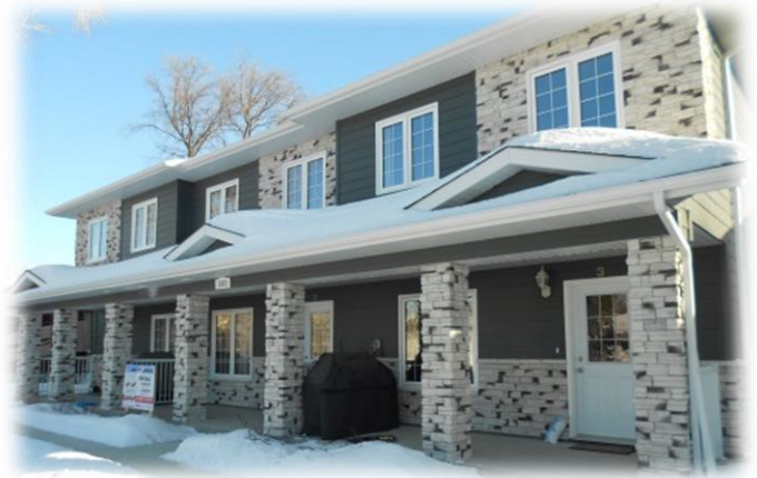
Figure 15: Residential development with variety of materials and well-articulated façades