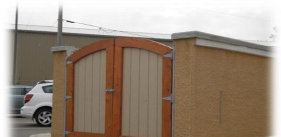
Figure 5: Refuse screening with design elements of principal building