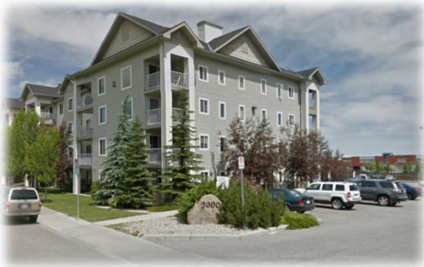
Figure 4: Residential parking area internal to the site