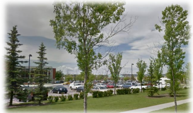
Figure 17: Landscaped area around parking lot