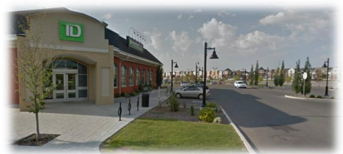
Figure 3: Parking area designed to reduce vehicle and pedestrian conflicts