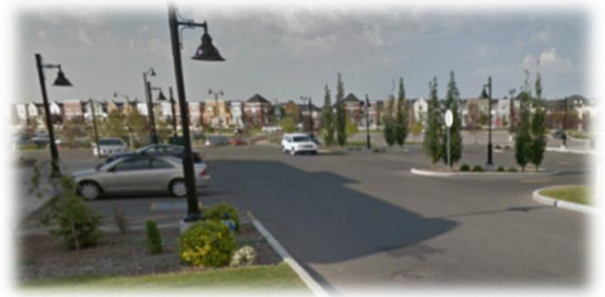
Figure 9: Decorative light fixtures