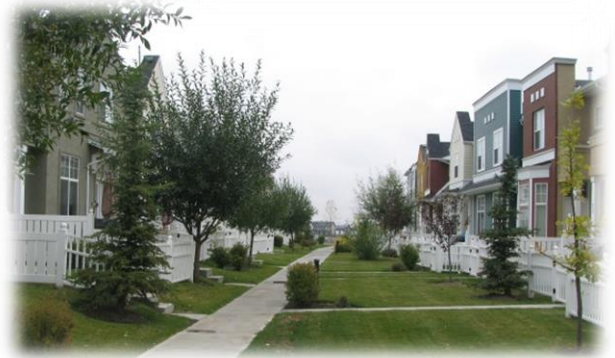
Figure 1: Pedestrian route through townhouse development