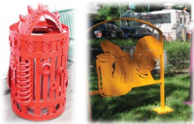
Figure 11: Public art serving multiple purposes