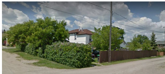
Figure 1 & 2: Current Property, Existing house to be demolished.