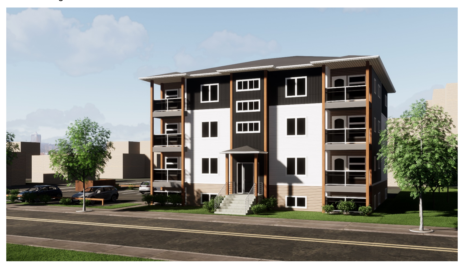
Figure 4: Proposed Development.

The proposed development is a 3.5 storey multiplex having a footprint of 2603 square feet (241.8 square meters). The multiplex will have 8 residential suites. We have designed our building to face Rosser Avenue at the request of the City Planning Department. Please see Figure 4 below as a reference for the proposed look of the building.