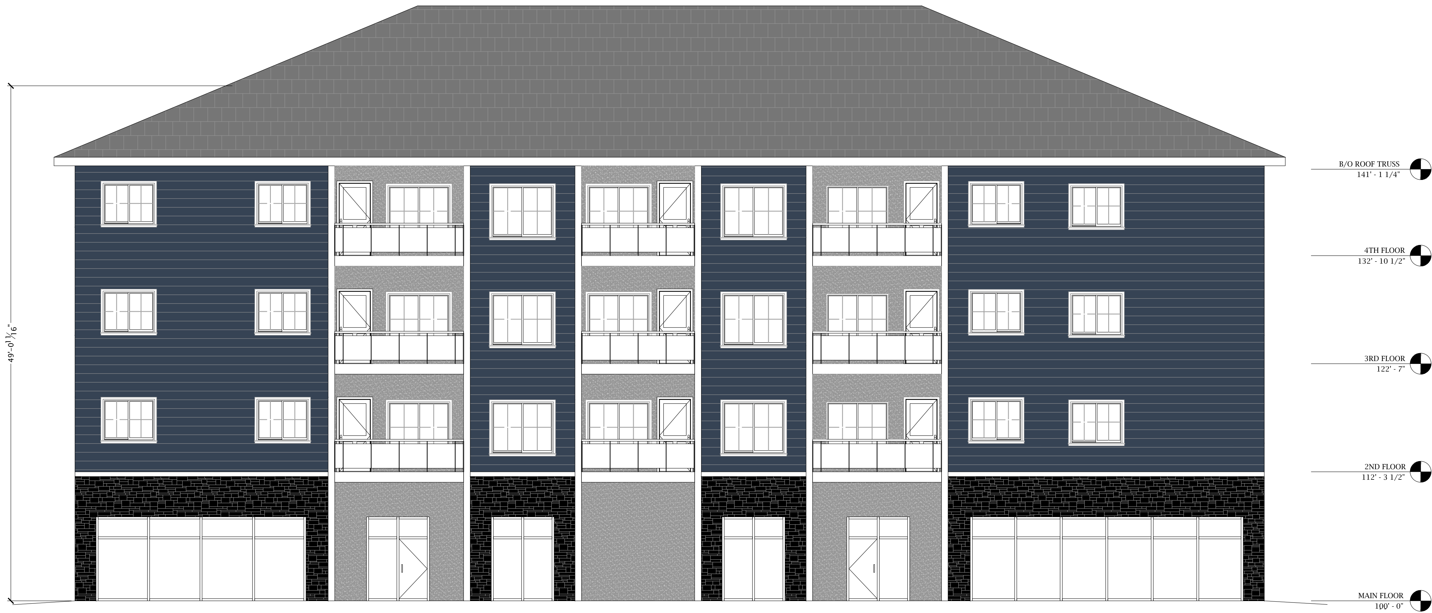
① NORTH ELEVATION SCALE: 3/16" = 1'0"

PRELIMINARY FOR DISCUSSION PURPOSES ONLY