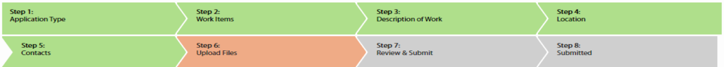
Permit Application - Upload Documents