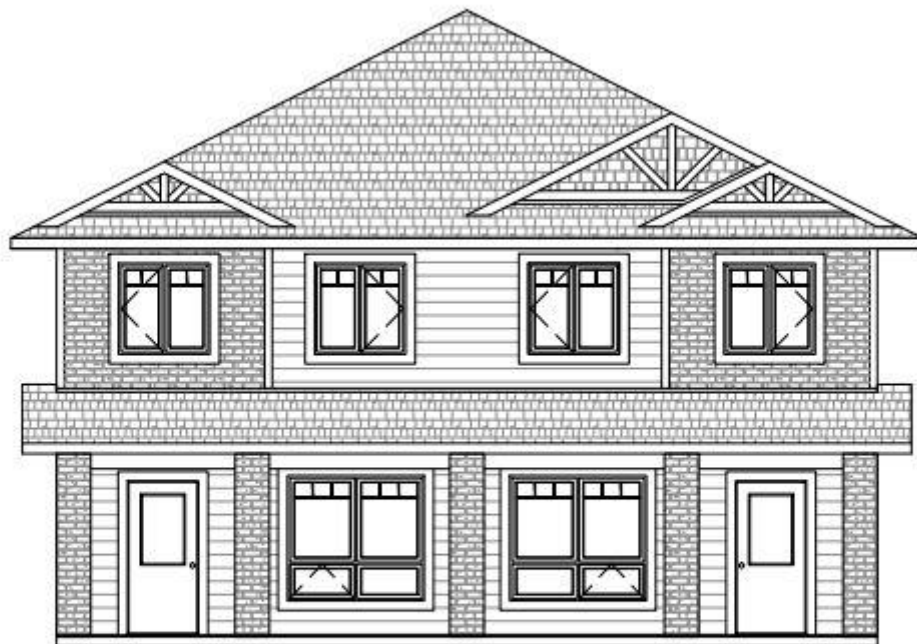
E1 EAST & WEST EXTERIOR ELEVATIONS 1:100