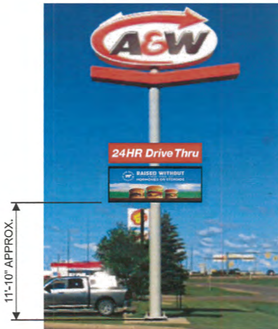
NEW SIGN PROPOSAL- SCALE 1:110