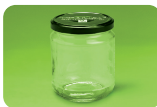
Glass bottles and jars: Clear and coloured jars and bottles