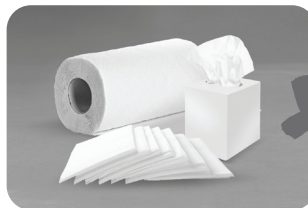
Paper towels, tissues, and napkins