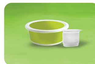
Plastic Containers: Plastic bottles and jars, laundry jugs, and yogurt tubs