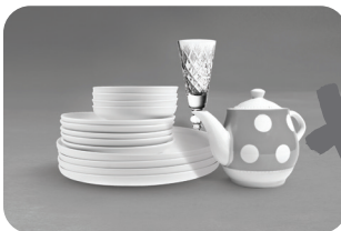
Dishes and ceramics