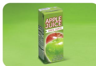
Cartons: Milk cartons, juice boxes, and soup cartons