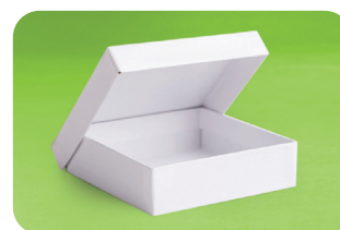
Cardboard and boxboard: Cereal boxes, cardboard boxes, and cardboard tubes