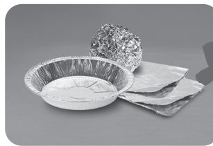
Aluminum foil, pie plates, and trays