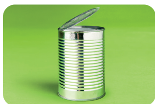
Steel food and beverage containers: Soup cans and pet food tins