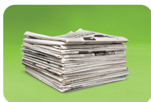
Printed Paper: Newspapers, magazines, flyers, and home office paper

These are some examples of types of recyclable materials accepted in your recycling program: