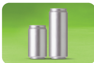
Aluminum food and beverage containers: Soft drink cans and sardine cans