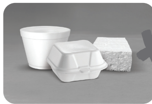
Foam packaging of any kind