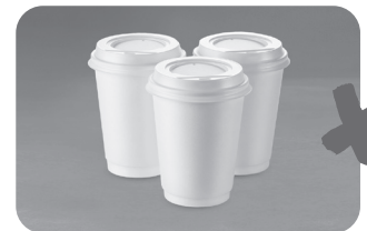
Take out beverage cups